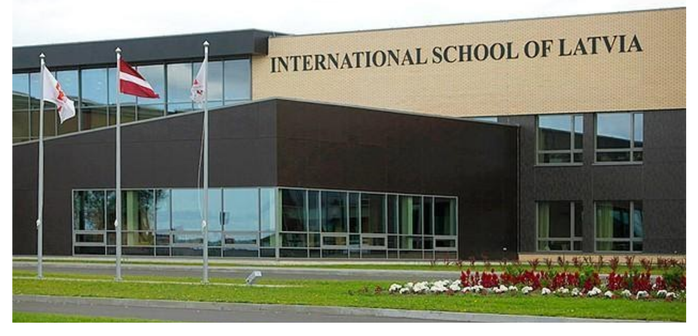
"We are an inclusive community learning for an ever changing world"